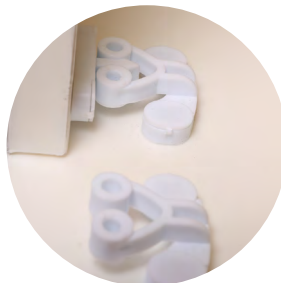
Poly accessories means there are no metal parts to corrode