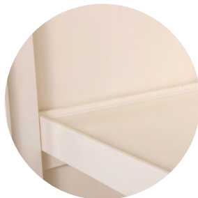
Reversible shelves with band edges meet diverse choices of users