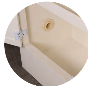
Fully welded, liquid-tight sump