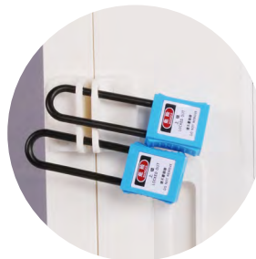
Double locks for security against unauthorized use. (No include)