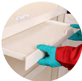
Drawers for temporary operation and MSDS storage (48Gal only)