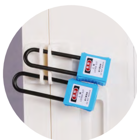
Double locks for security against unauthorized use. (No include)