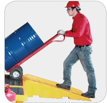
Poly spill pallet ramps make it easier to move large articles