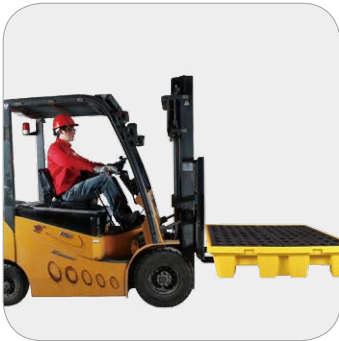
2-drum and 4-drum spill pallets have forklift slots for convenient forklift operation to improve efficiency (*forklift overload prohibited)