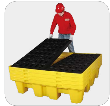
2-drum and 4-drum spill pallets with stackable structure save space and transportation costs