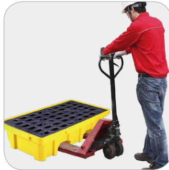
Hydraulic carrying vehicles can also be used to move pallets, which is more convenient