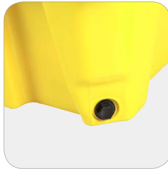
Hexagonal drain plug facilitates drainage