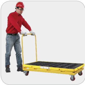
2-drum spill pallets with stackable structure save space and transportation costs