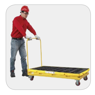
2-drum spill pallets with stackable structure save space and transportation costs