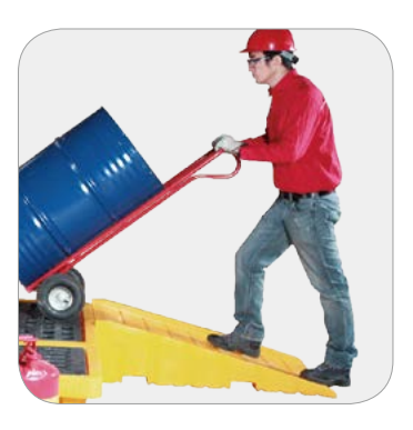
Poly spill pallet ramps make it easier to move large articles