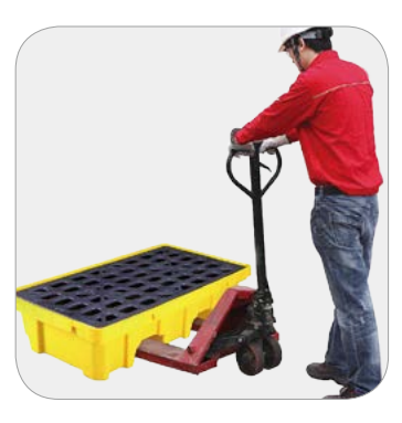
Hydraulic carrying vehicles can also be used to move pallets, which is more convenient