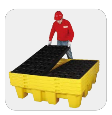
2-drum and 4-drum spill pallets with stackable structure save space and transportation costs