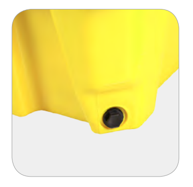
Hexagonal drain plug facilitates drainage