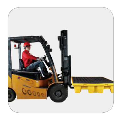
2-drum and 4-drum spill pallets have forklift slots for convenient forklift operation to improve efficiency (*forklift overload prohibited)