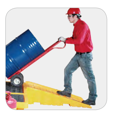
Poly spill pallet ramps make it easier to move large articles