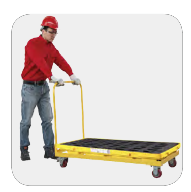
2-drum spill pallets with stackable structure save space and transportation costs