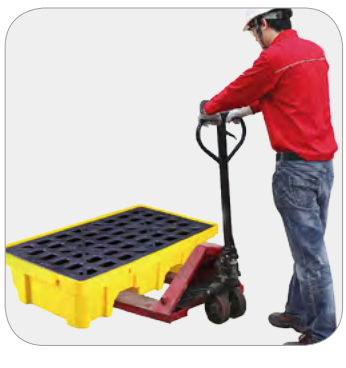
Hydraulic carrying vehicles can also be used to move pallets, which is more convenient