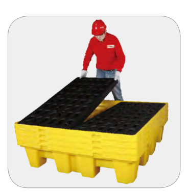
2-drum and 4-drum spill pallets with stackable structure save space and transportation costs