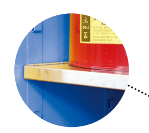
Adjustable shelves with antileakage design