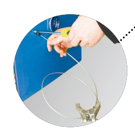
FM Approved Anti-Static Device:Conductor grip combine the equipment with the cabinet to conduct the static to earth, thus to prevent fire accident